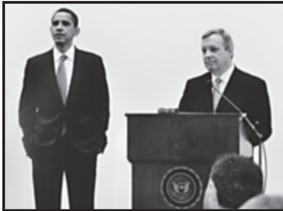
Pictured above from left to right are Illinois Senators Barack Obama and Richard Durbin as they listened to questions during their weekly "Breakfast" with constituents.

A number of the issues that were discussed included the following: repealing the 3% withholding on public contracts; seeking Federal Contracting reforms - banning reverse auctions, misclassification of employees as independent contractors; addressing immigration reform and guest worker proposals; Green Building proposals. The Conference included briefings, addresses by legislative leaders and face-to-face meetings with members of Congress and/or their staffs. The Chicago and Cook County Chapter, NECA was well represented. A number of Congressmen were able to meet with our group. The information shared should prove beneficial as the year progresses. We thank those ECA members who were able to join their industry colleagues and were able to voice their opinions to advance the industry.